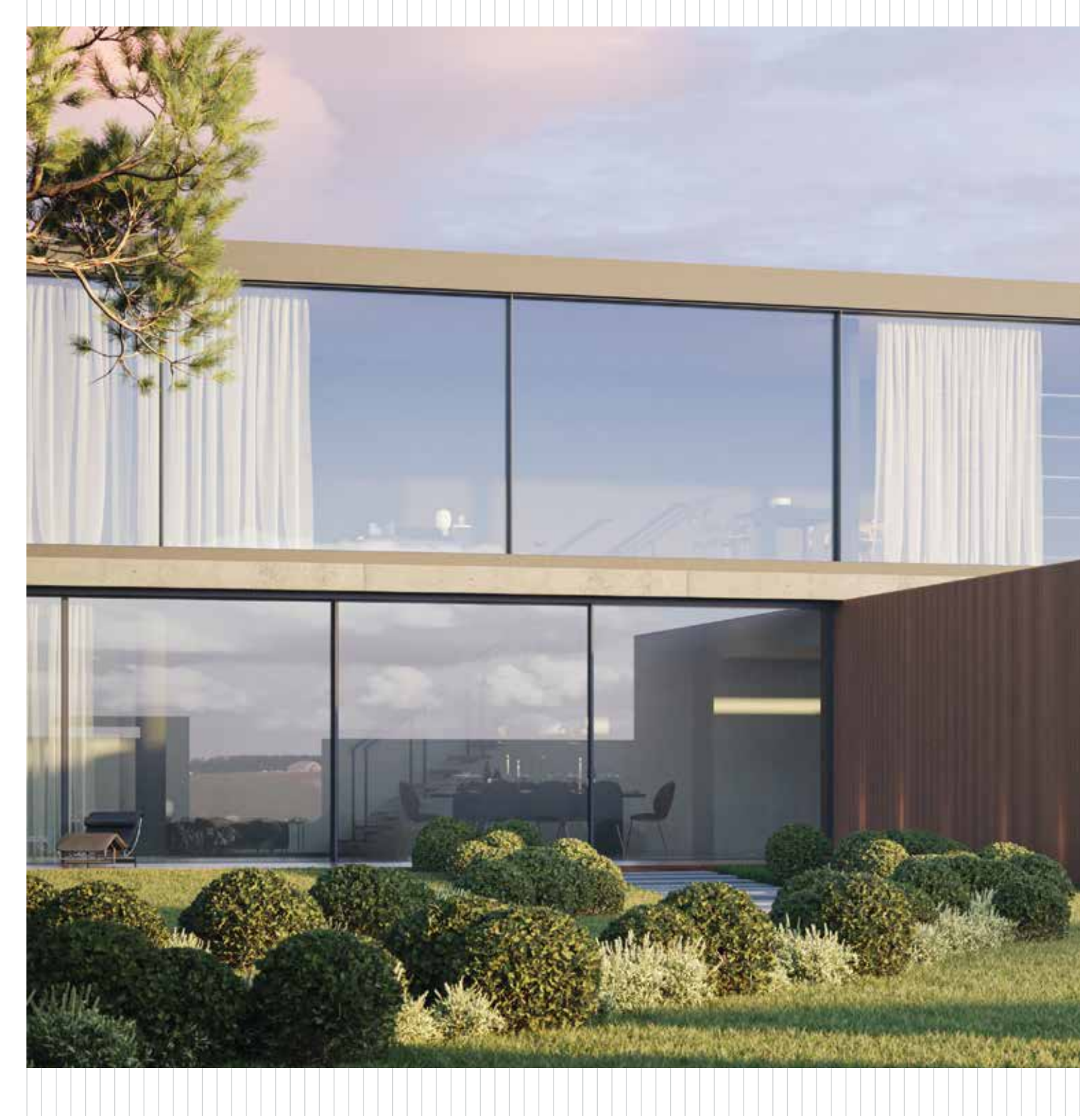
Features & Benefits